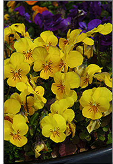
Penny Yellow Pansy flowers

Penny Yellow Pansy is recommended for the following landscape applications;