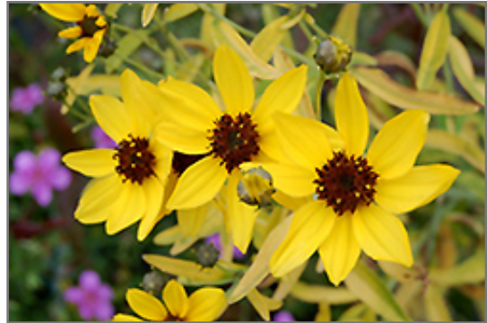
Lightning Flash Tickseed flowers