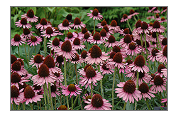
Pixie Meadowbrite Coneflower flowers