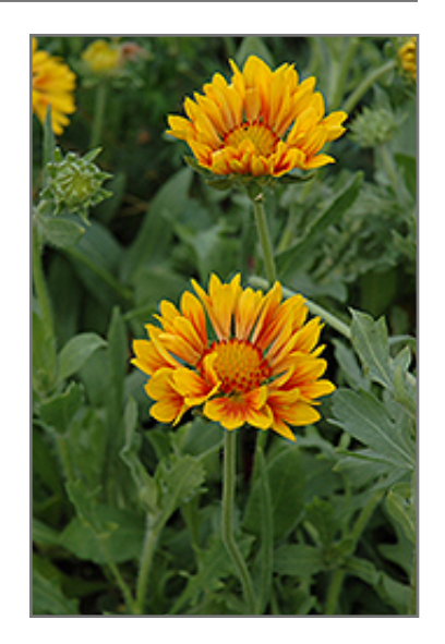
Oranges And Lemons Blanket Flower flowers