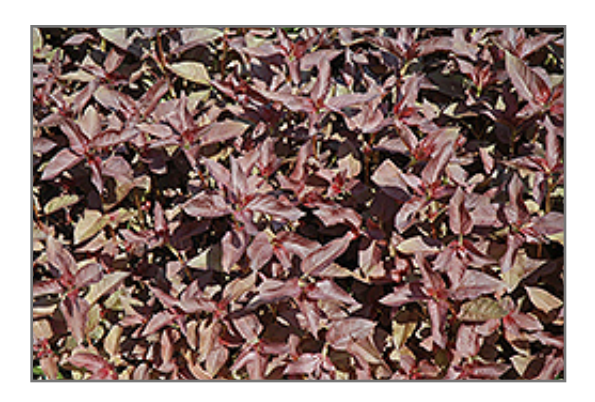
Purpleleaf Loosestrife foliage

17999 WCR 4 Brighton, CO, 80603 phone: 303-775-9629 www.incolorme.com