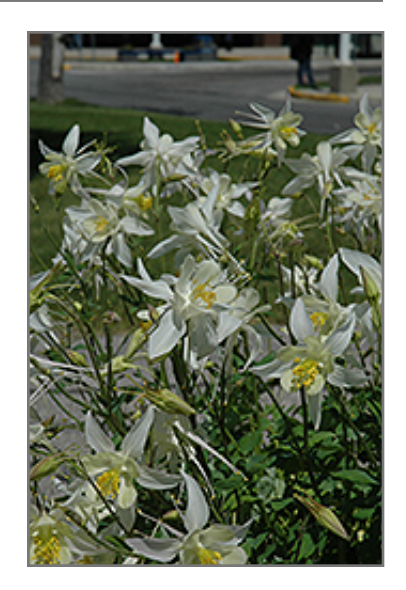
Biedermeier White Columbine flowers