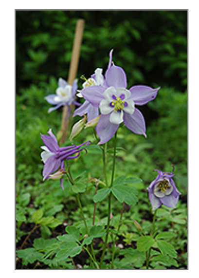
Swan Blue and White Columbine flowers