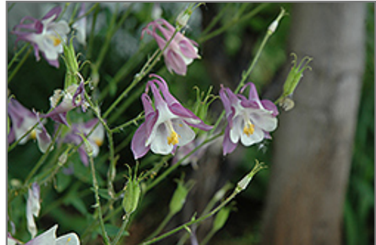
Common Columbine flowers

Common Columbine is recommended for the following landscape applications;