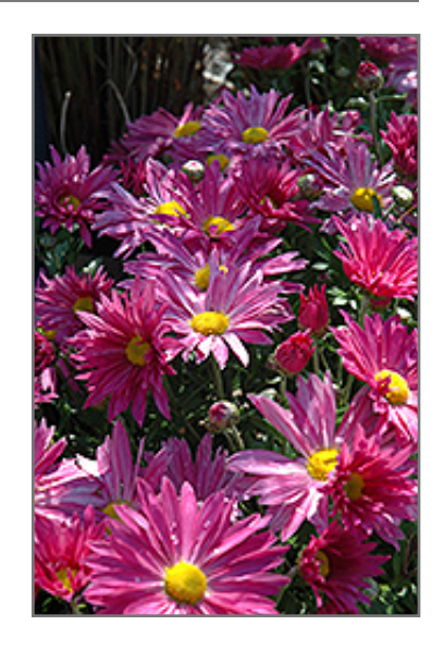
Dark Pink Daisy Chrysanthemum flowers