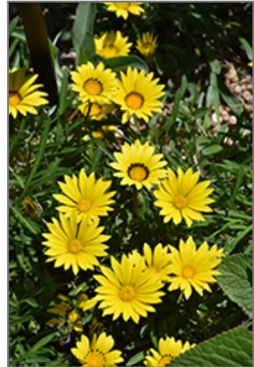
Colorado Gold Gazania flowers

Colorado Gold Gazania is recommended for the following landscape applications;