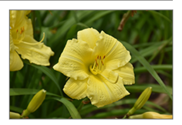
Rainbow Rhythm Going Bananas Daylily flowers