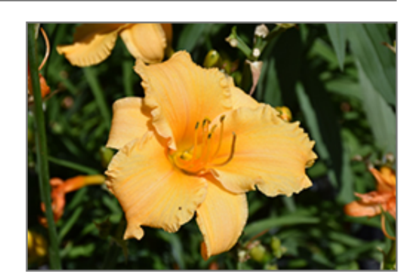
Happy Ever Appster Apricot Sparkles Daylily flowers

Pretty, reblooming miniature trumpets in a luminous peachy-orange hue with ruffled edges, strong, easy to care for, great grassy texture and form; good for the