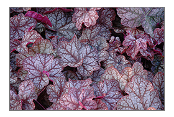
Encore Coral Bells foliage