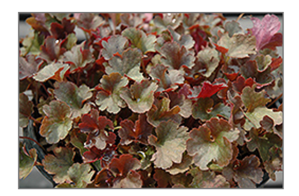
Petite Pearl Fairy Coral Bells foliage