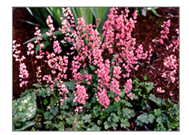
Strawberry Candy Coral Bells in bloom