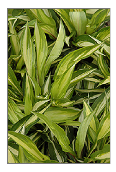
Cherry Berry Hosta foliage