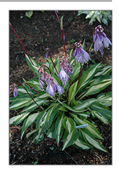
Cherry Berry Hosta in bloom