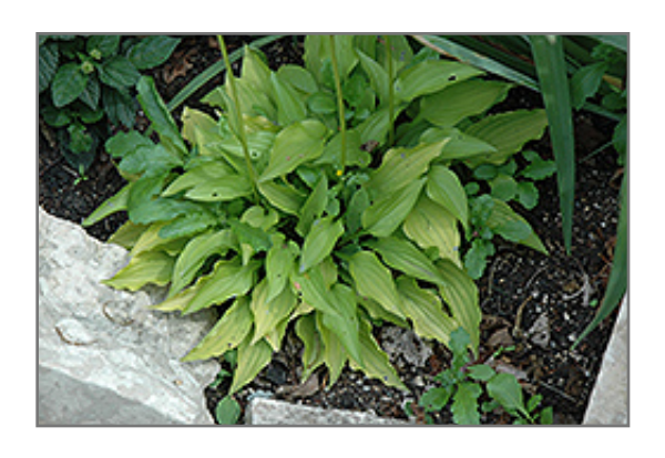
Ground Sulphur Hosta Photo courtesy of NetPS Plant Finder