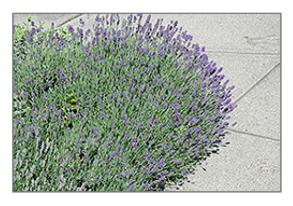
Munstead Lavender in bloom