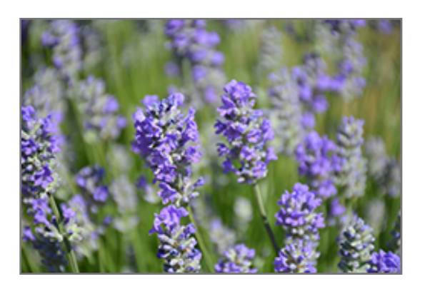
Munstead Lavender flowers