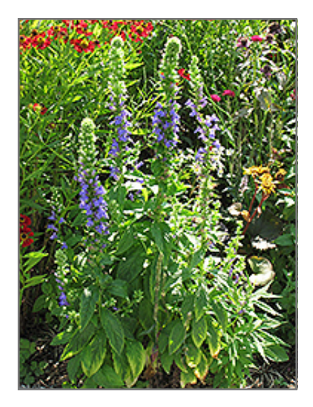
Blue Cardinal Flower in bloom