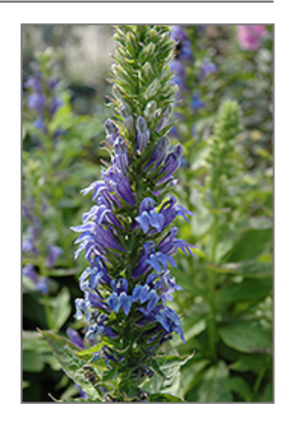
Blue Cardinal Flower flowers