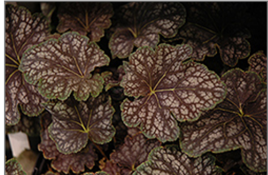
Beauty of Color Coral Bells foliage