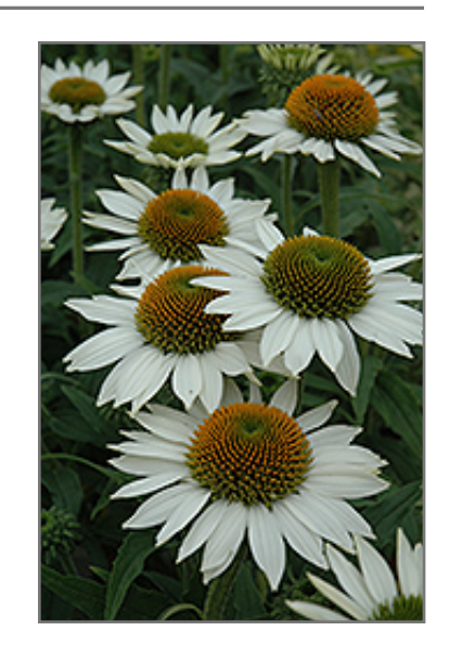
Purity Coneflower flowers