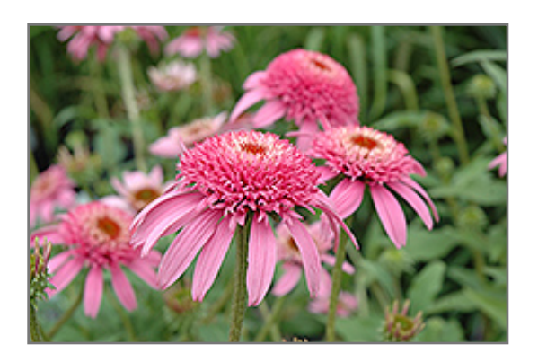
Cone-fections Pink Double Delight Coneflower flowers