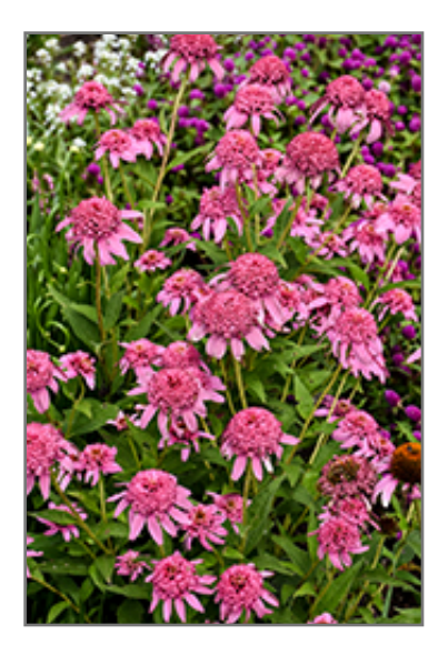
Cone-fections Pink Double Delight Coneflower flowers