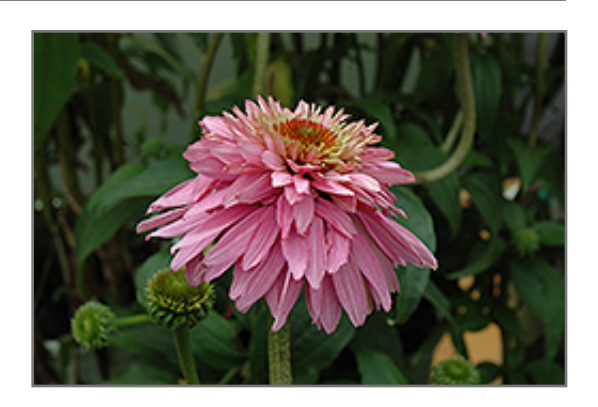
Pink Poodle Coneflower flowers