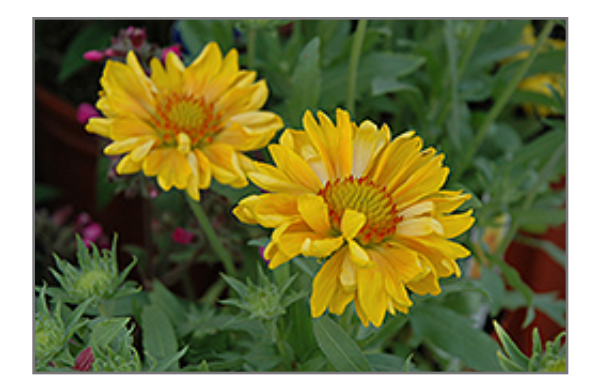
Sunburst Tangerine Blanket Flower flowers