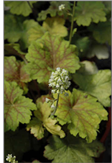
Electra Coral Bells flowers