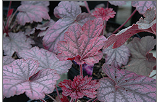
Midnight Bayou Coral Bells foliage