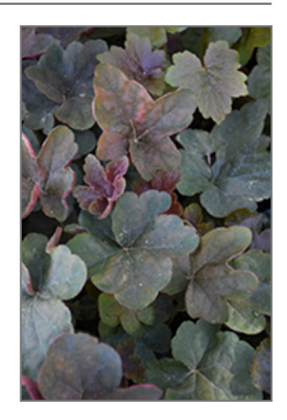
Mocha Coral Bells foliage