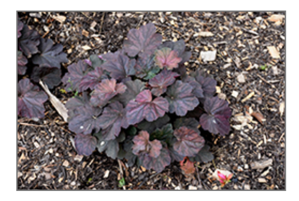
Mocha Coral Bells