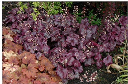
Plum Royale Coral Bells in bloom