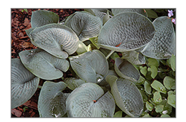
Abiqua Drinking Gourd Hosta foliage