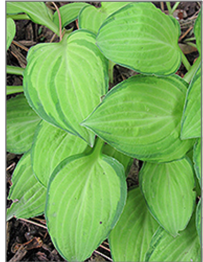
Emerald Tiara Hosta foliage