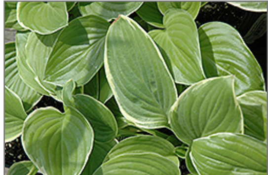
Frozen Margarita Hosta foliage