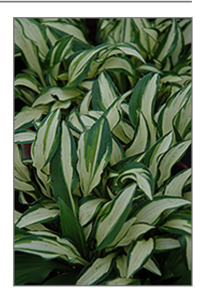
Lakeside Elfin Fire Hosta foliage