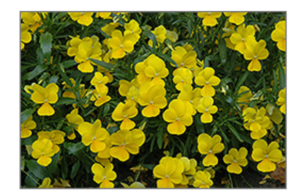
Rebel Yellow Pansy flowers