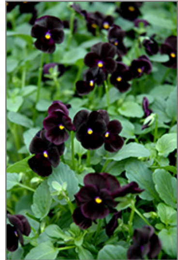
Sorbet Black Delight Pansy flowers

Sorbet Black Delight Pansy is recommended for the following landscape applications;