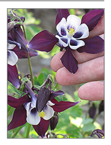
William Guinness Columbine flowers