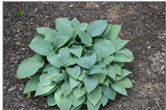
Carolina Blue Hosta