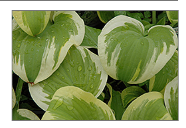
Delta Dawn Hosta foliage

Graceful large hosta has large olive leaves with a wide creamy margin; leaf centers age to a yellow green; provides beautiful texture and contrast to other plants; lavender spikes of flowers in early to mid-summer