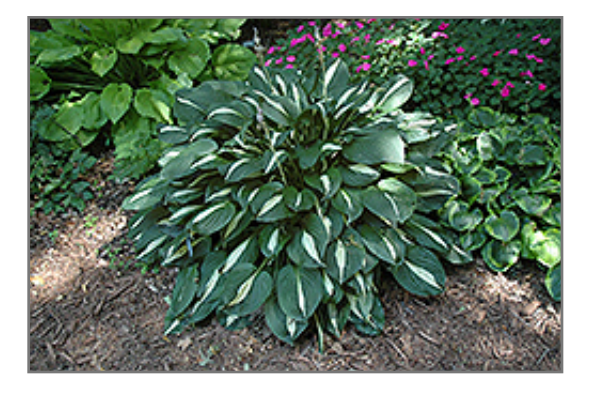
Risky Business Hosta