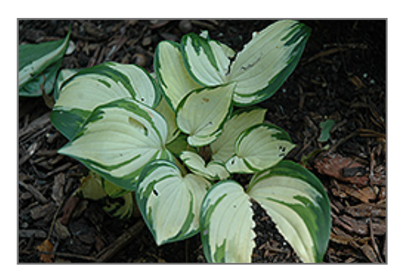
Warwick Delight Hosta foliage