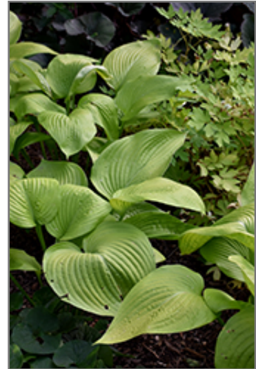
Key West Hosta

This plant does best in partial shade to shade. It prefers to grow in average to moist conditions, and shouldn't be allowed to dry out. It is not particular as to soil type or pH. It is somewhat tolerant of urban pollution. This particular variety is an interspecific hybrid. It can be propagated by division; however, as a cultivated variety, be aware that it may be subject to certain restrictions or prohibitions on propagation.