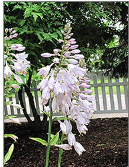
Key West Hosta flowers