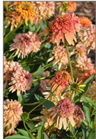
Cone-fections Marmalade Coneflower flowers