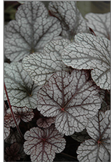
Prince Of Silver Coral Bells foliage