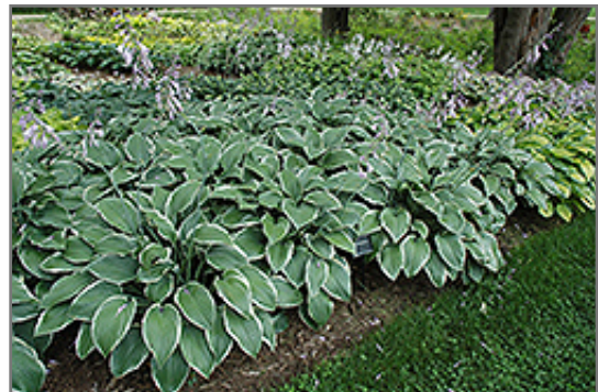
Winter Snow Hosta in bloom