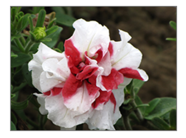
Double Madness Red and White Petunia flowers