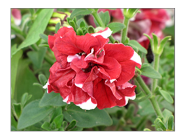
Double Madness Red and White Petunia flowers

This plant should only be grown in full sunlight. It does best in average to evenly moist conditions, but will not tolerate standing water. It is not particular as to soil type or pH. It is highly tolerant of urban pollution and will even thrive in inner city environments. This particular variety is an interspecific hybrid. It can be propagated by cuttings; however, as a cultivated variety, be aware that it may be subject to certain restrictions or prohibitions on propagation.