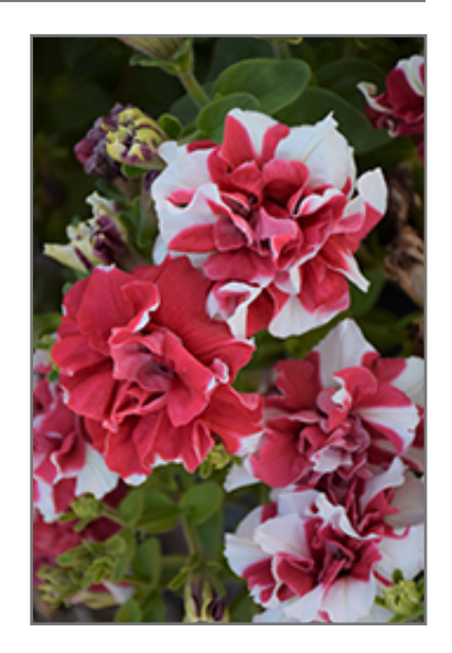
Double Madness Red and White Petunia flowers