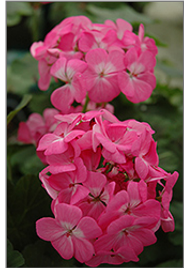
Pillar Pink Geranium flowers