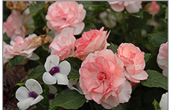
Fiesta Ole Peach Double Impatiens flowers