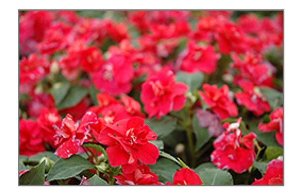
Fiesta Salsa Red Double Impatiens flowers