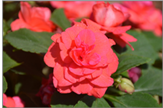
Rockapulco Coral Reef Impatiens flowers