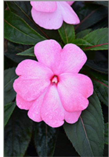
Super Sonic Pastel Pink New Guinea Impatiens flowers