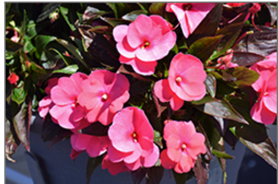
Sonic Pink New Guinea Impatiens flowers